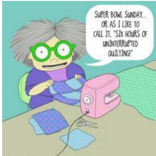
Super Bowl Sunday . . . or as I like to call it, "Six Hours of uninterrupted quilting"